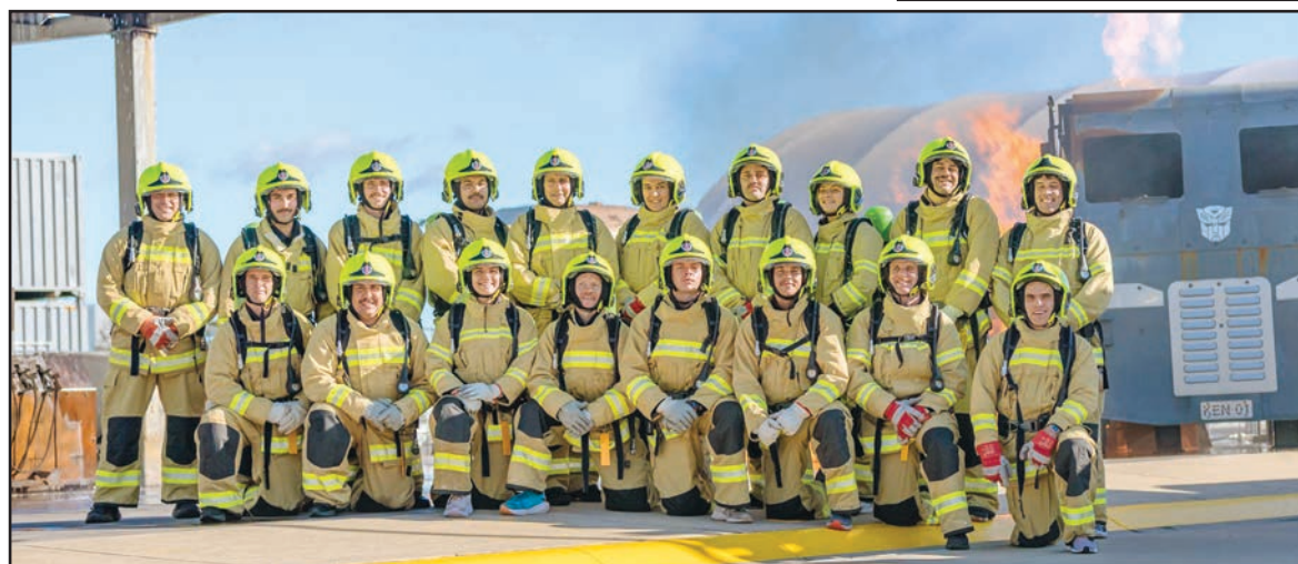
Indigenous Fire and Rescue Employment Strategy Program (IFARES) recruits.