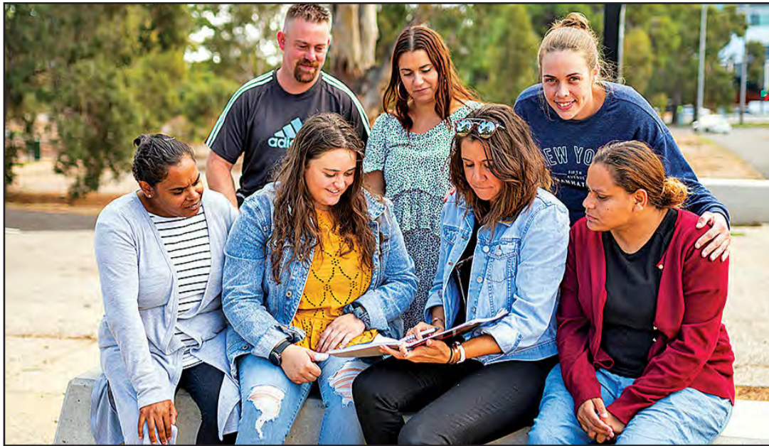
The University of South Australia's Aboriginal Pathways Program has been providing support to Aboriginal students wanting to achieve their academic and career goals through further education.